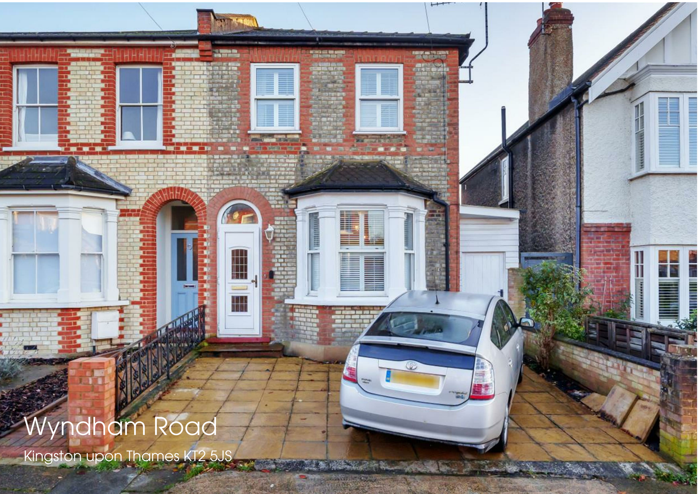
Wyndham Road Kingston upon Thames KT2 5JS

34 Richmond Road Kingston upon Thames Surrey KT2 5ED www.gibsonlane.co.uk Tel: 020 8546 5444